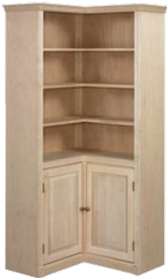
MFC 30x72x12 -BK7

72" and taller are available in 2 pieces in order to make it easier to get into your home or room.